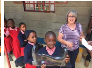
Receiving their Rain boots